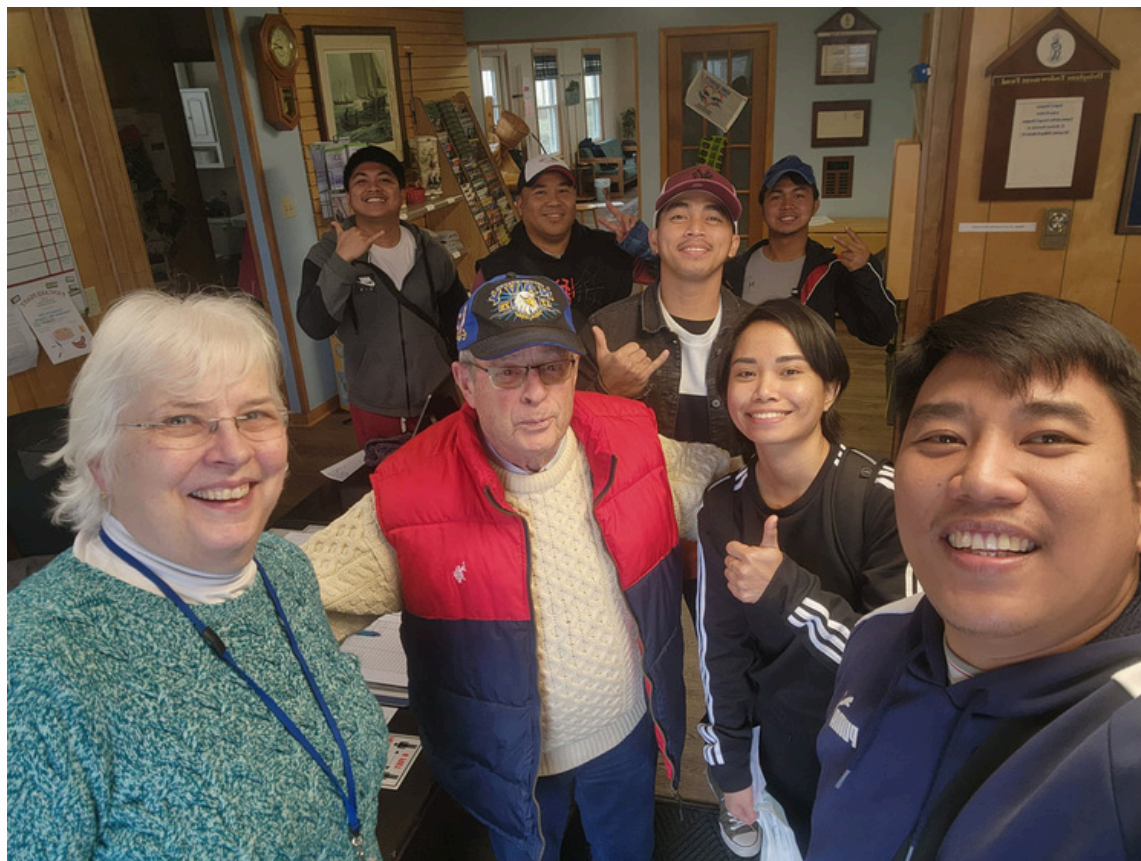
Staff and sailors at the Wilmington Seamens Center